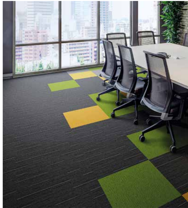
TOP LEFT: With the Modern Craft technique, Carpets Inter introduces several different shapes that can be combined to create limitless floor layouts.

To raise the design bar even higher, Carpets Inter's design team has rolled out Modern Craft, an extension of the Mix It Up concept. Clients can customize their floor using modified tile shapes and sizes, thus adding another layer of creativity in terms of floor layout. Available in wide planks, skinny planks, mini planks, triangles, and square tiles, the Modern Craft carpet tiles are entirely adaptable to the needs of a project and can be used individually or in combination with 50x50cm square tiles to achieve a truly unique and inspired design for an office installation of any size.