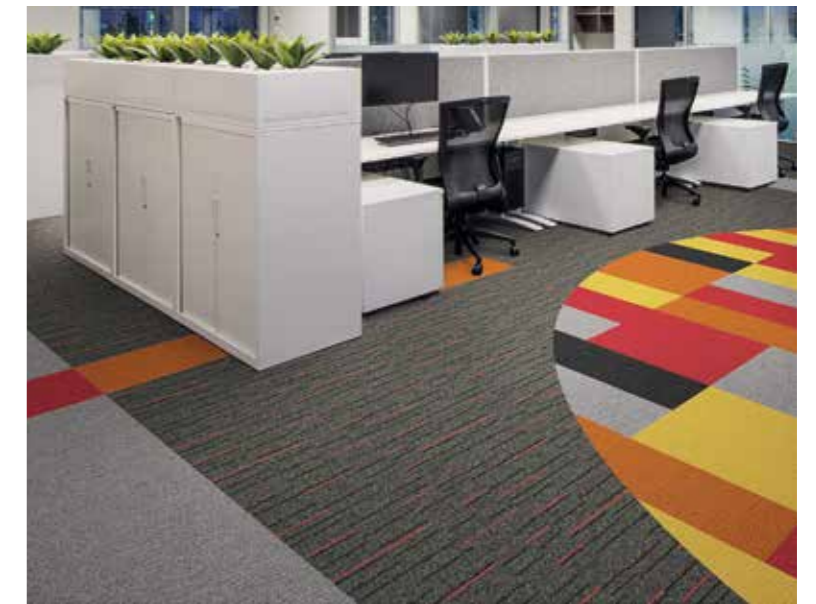
BOTTOM: A colourful combo of Mix-It-Up and Modern Craft carpet tiles energizes an open office workspace and says, 'Welcome.'