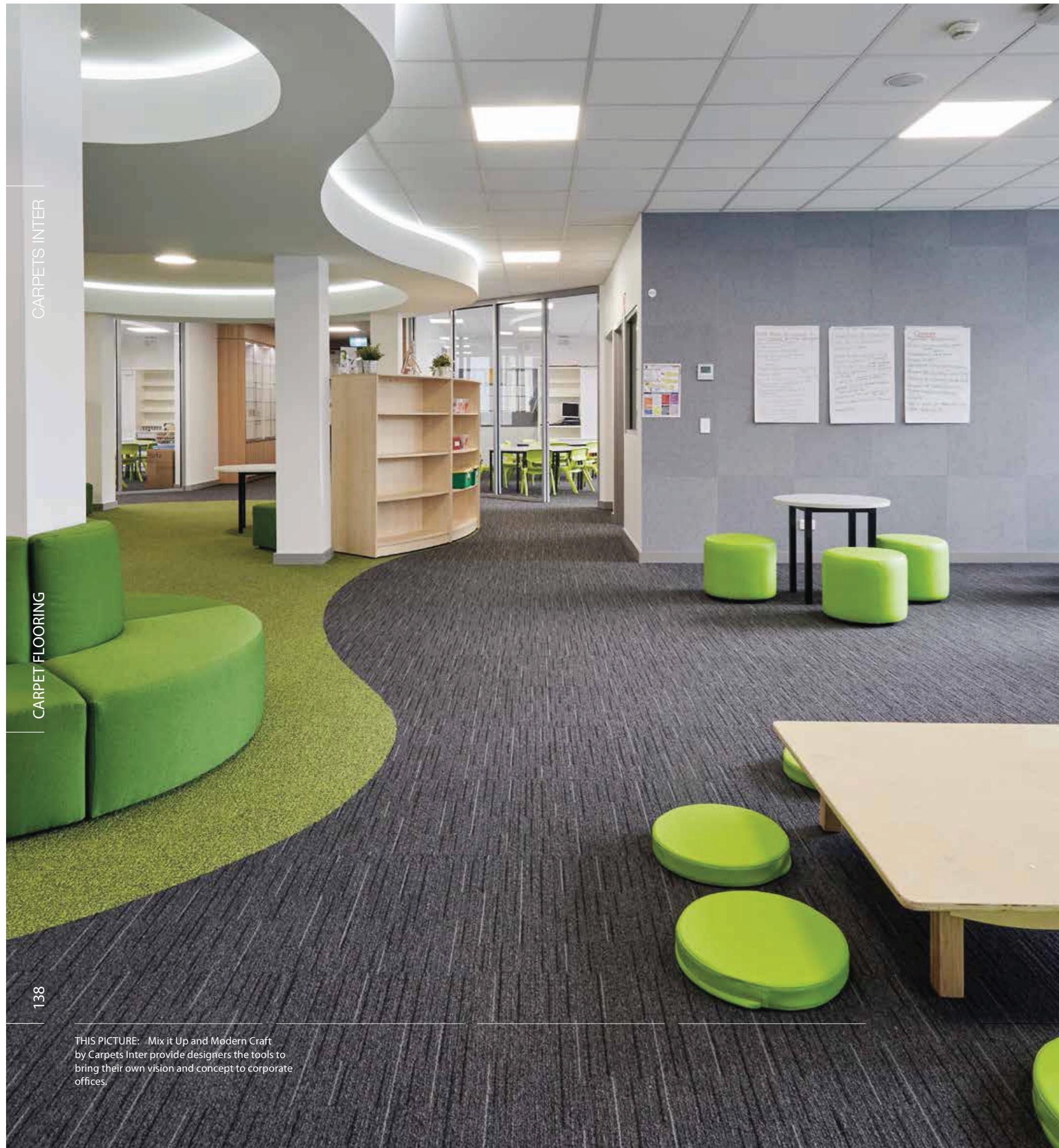
THIS PICTURE: Mix it Up and Modern Craft by Carpets Inter provide designers the tools to bring their own vision and concept to corporate offices.